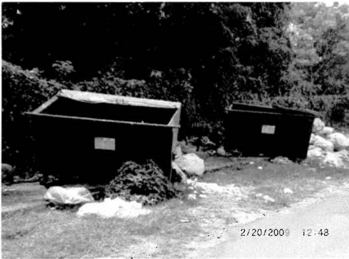
Dumpsters at DL Perez emptied on February 20, 2009 at 12:48