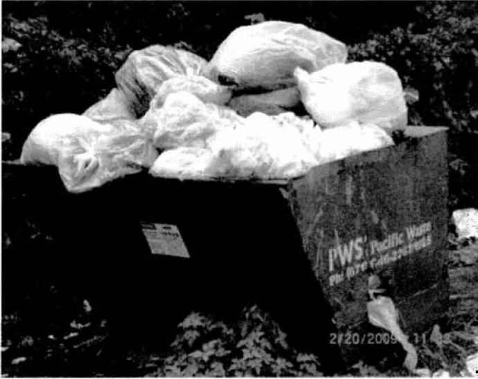
Dumpster 1 overflowing at DL Perez Friday February 20, 2009 at 11:33 a.m. Note: Visible hole in side of dumpster