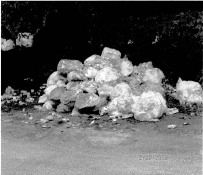
Trash piled up at DL Perez on Friday February 20, 2009 at 11:34 a.m.