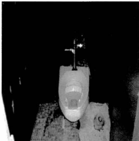
No toilet tissue dispenser. Note roll of wet toilet tissue on floor.