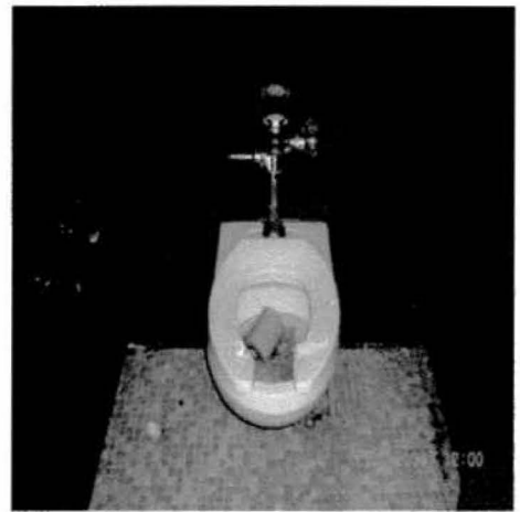
Missing toilet tissue holder. Note roll of toilet tissue in bowl.