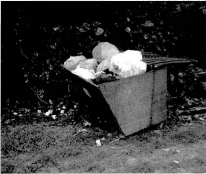
Dumpster 3 overflowing at DL Perez on Friday February 20, 2009 at 11:33 a.m. Note wheels in disrepair.