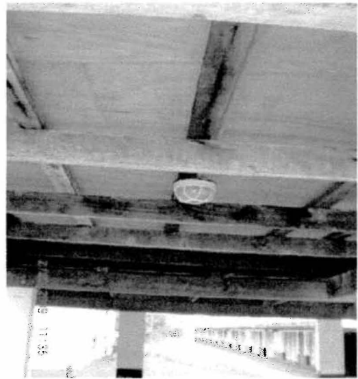
Bare wood on walk way awning near parking lot of DL Perez on Friday February 20, 2009 at 11:35