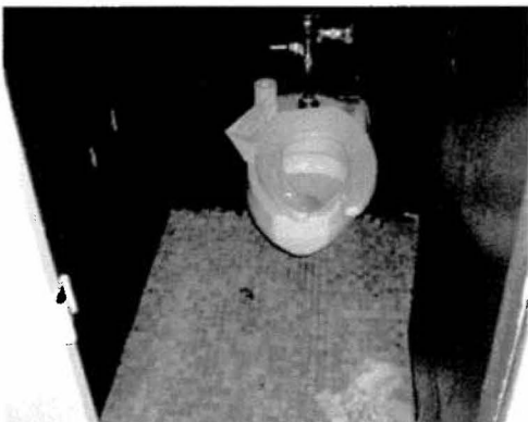
No toilet tissue dispenser. Note roll of toilet tissue on back of bowl and seat is not secured properly.