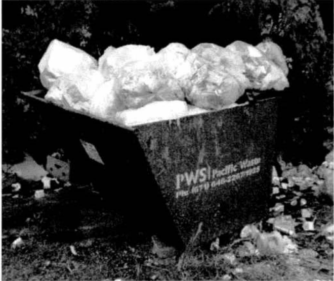
Dumpster 2 overflowing at DL Perez on Friday February 20, 2009 at 11:33 a.m.